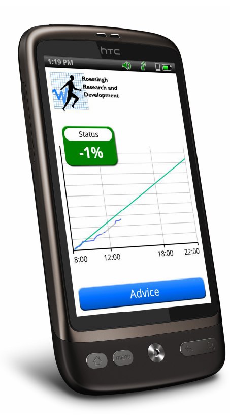
Figure 1: The Smartphone (HTC Desire) showing the graph screen, with reference line (green) and current activity (blue). The status icon shows the activity trend from the past 5 minutes.

Figure 1 shows an example screenshot of the Smartphone as used in the IS-ACTIVE project. The figure shows an HTC Desire running Android version 2.2, the phone used in the Romanian trials. In the Dutch trials, the follow-up device (HTC Desire S) is used. The figure shows the home screen of the application: a graph, displaying the patient's current activity pattern (in blue) and the predefined target (or reference line) in green. The green 'Status' box shows the deviation of the patient from the reference line in the last 5 minutes. In the Romanian trials, this box is used to display the current oxygen saturation value of the patient if he/she is wearing the sensor.