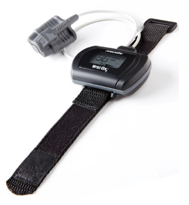
Figure 3: The WristOx2 3150 Pulse Oximeter from Nonin Medical Inc. The wristband contains a Bluetooth chip that connects to the Smartphone to transfer the measured oxygen saturation values.

The WristOx2 communicates with the Smartphone over Bluetooth to send its measured heart rate and oxygen saturation values. Both measures are then stored on the Smartphone, and the oxygen saturation values are displayed on the screen for the patient, as explained earlier in this section.