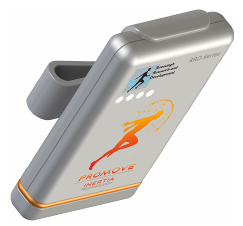
Figure 2: The ProMove 3D wireless inertial sensor, pictured here as a 3D render with an attached belt clip for mounting on the patient's hip.

Each minute 6 of these 10-second activity count values are send over Bluetooth to the Smartphone.