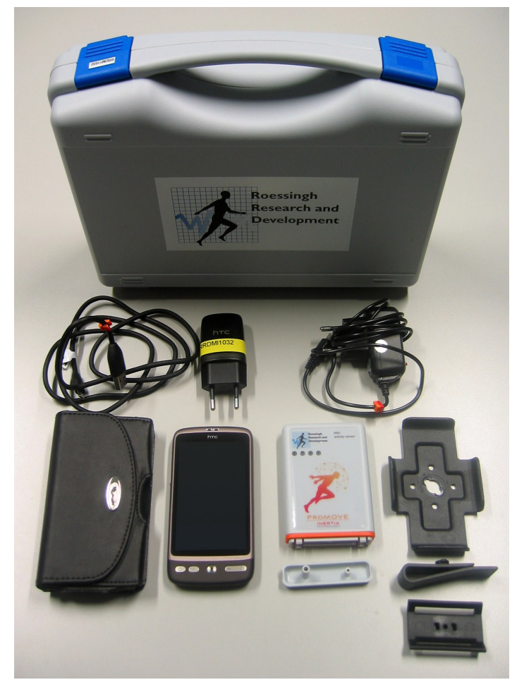
Figure 4: The contents of the measurement kit given to the IS-ACTIVE patients.

In their first week of measuring, while gathering the patient's baseline activity, the patient will not be able to see their activity levels on the Smartphone; instead they only see the messages "measurement in progress". This is to ensure that we are not influencing the patient's activity behavior during the baseline measurements.