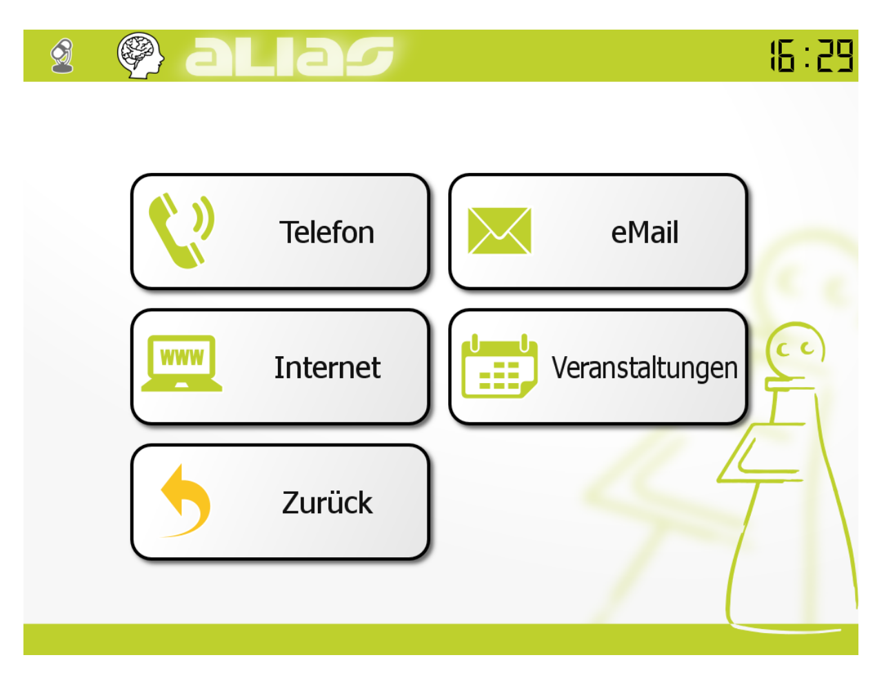
Figure 1: ALIAS GUI with the communication modules

The integration of a translation module into the chat module is displayed in Figure 2. In this figure, only the communication in one way is displayed. Analogously, communication in the other way is performed. Without the translation module, the input messages from the user are directly transmitted to the other communication partner. When the translation module is enabled, all messages are transmitted through this module.