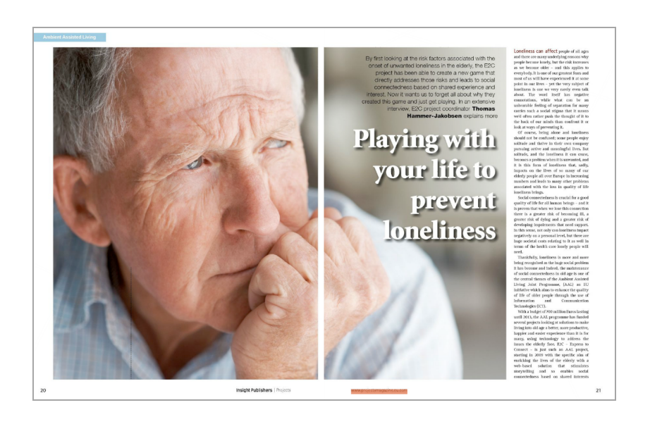
Figure 4. Article "Playing with your life to prevent loneliness" in Projects Magazine

During the summer of 2012 it was discussed with the Insight Publishers that the Consortium would publish a project site on the SEED research Library. A SEED is an interactive digital brochure that uses a variety of media and therefore, fox example, the Storyville games would have been possible to present through the service. Due to the high cost of the service and low amount of visitors on the SEED website the proposal was rejected.