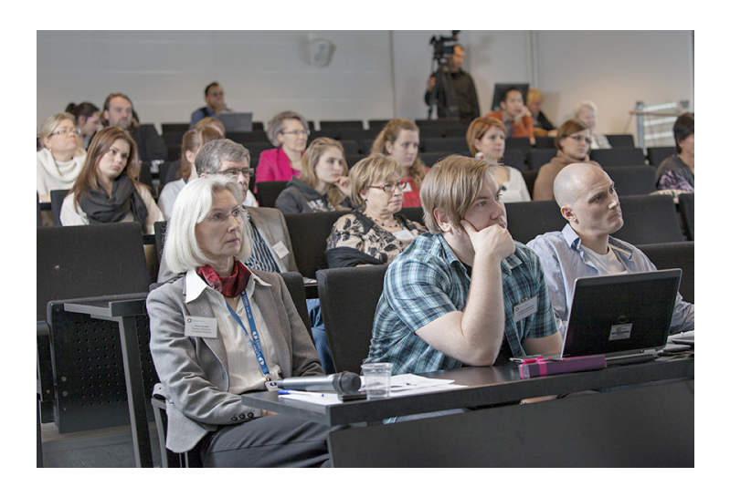
Figure 6. Participants for the E2C seminar at Laurea University of Applied Sciences.

Presentations and materials via can be viewed through the Webinar link: <a href="http://www.seminaarit.net/fi/seminaarit/express2connect/">http://www.seminaarit.net/fi/seminaarit/express2connect/</a>