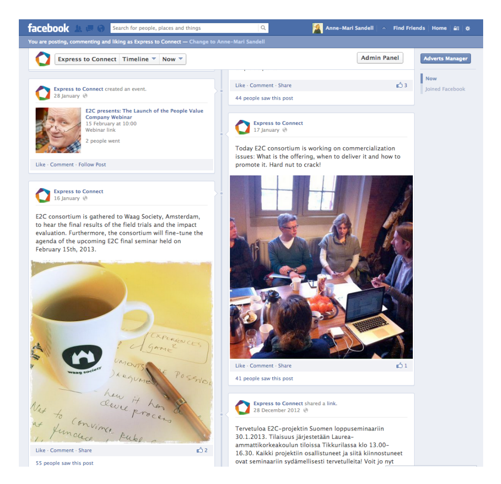
Figure 1: Examples of status updates on the Express to Connect Facebook page.

Although the amount of followers on the E2C Facebook page has remained lower than expected (by the end February 2013 there were 87 followers) the Facebook has been a valuable addition to the dissemination tool kit. The project has been able to promote the events as well as to communicate the recent developments of the project through the Facebook and another Web 2.0 channels. During the year 2012 photos were added to most of the posts, which was proved to attract more "Likes" for the posts (See figure 1).