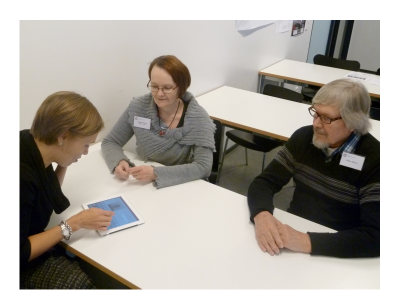
Figure 7. Gaming session during the National final seminar in Finland.