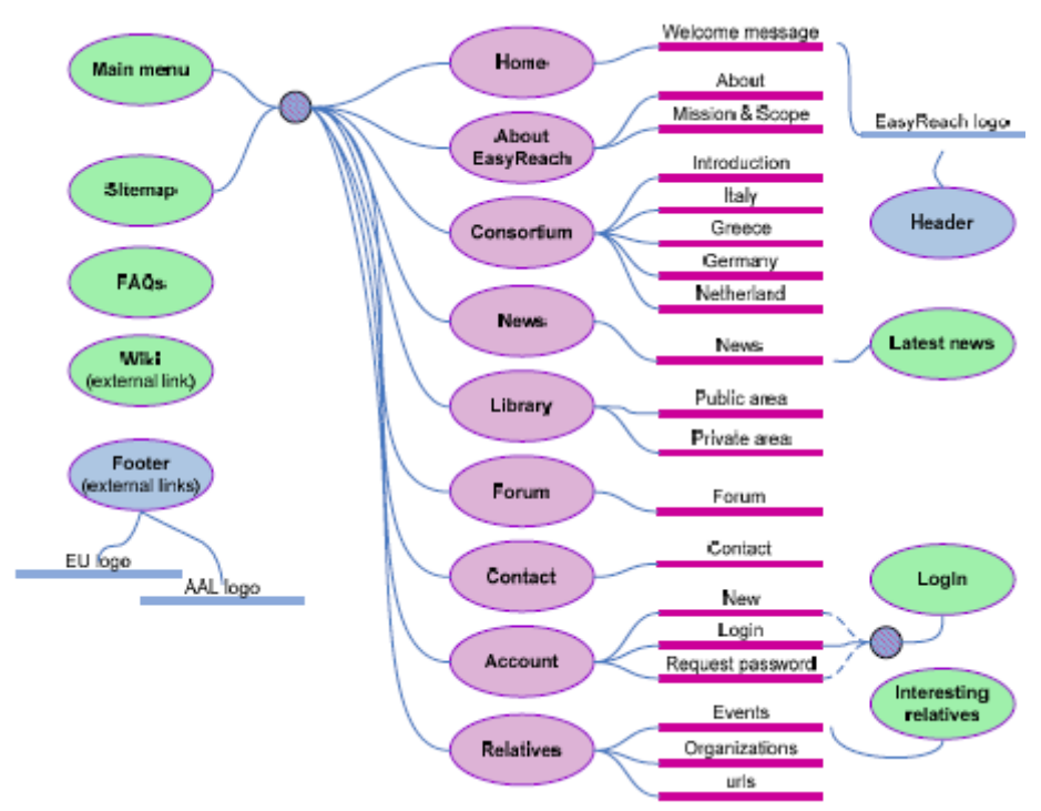
Figure 2: Links and transitions

The links and transition between the distinct functional parts (links and pages) of EasyReach web site are graphically presented in the diagram above.