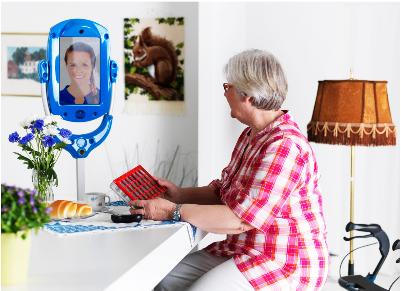
Figure 1: Giraff allows remote healthcare - elderly communications

To perform the user based evaluations, a stage one prototype will be deployed to the targeted end-users (Fig. 1). The prototype is called the Giraff system and consists of a screen and web camera mounted on a simple robotic base that can be teleoperated. The camera and screen is a pan-tilt unit which enables a greater and controllable field of view and the height of the unit is easily adjustable. The elegance of the Giraff system is its simplicity and thus its affordability with a current estimated price tag of 5000 Euros and a possibility to reduce the price to as little as 2000 euros in the future as the product matures and manufacturing scale is achieved.