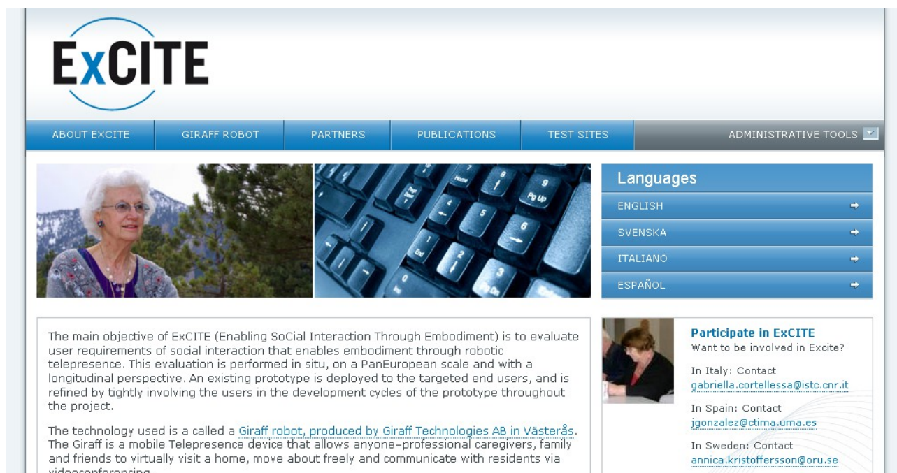
Figure 5: ExCITE website's front page

According to ExCITE website visitor statistics, more than 8000 pageviews have been made in the period from September 2010 till June 2012. Please, see Fig. 3 for monthly statistics.