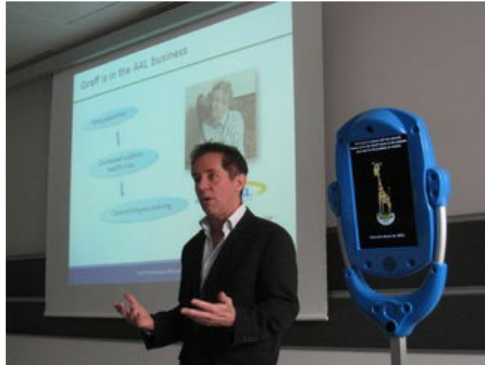
Figure 3: Talk at HRI2011 Workshop on Social Robotic Telepresence

At the same time, members of the ExCITE consortium participated and organized a number of events, which are listed below: