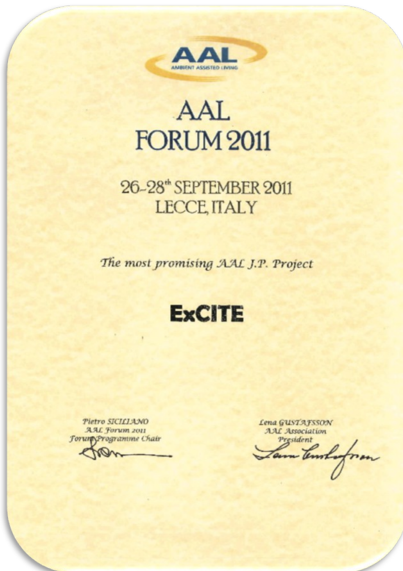
Figure 4: AAL forum award