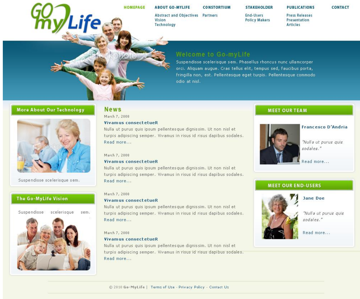
Figure 2: website sketch no°1