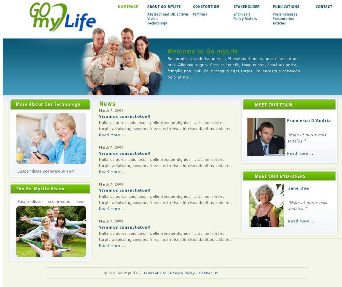
Figure 4: website sketch n°3