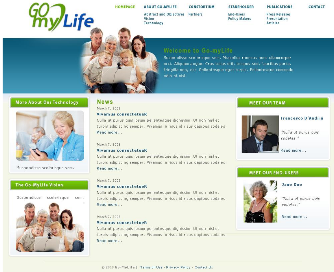
Figure 3: website sketch n°2