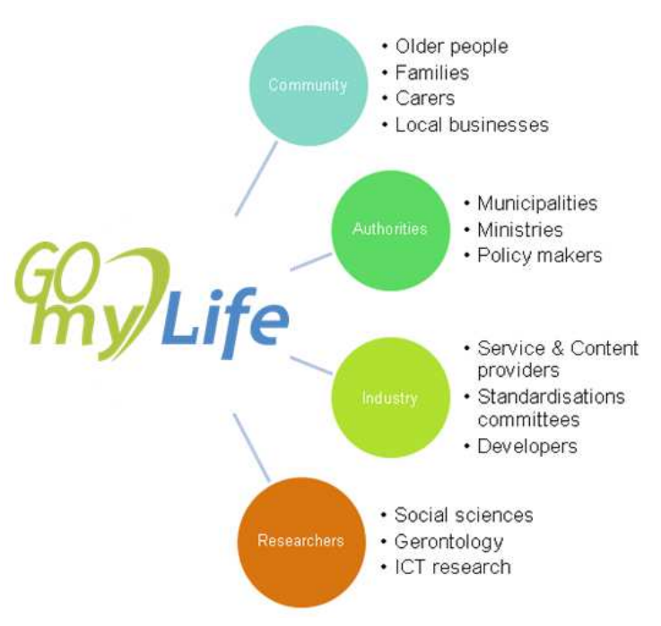
Figure 3: Target audience preliminary mapping

As presented in Figure 3, we map our target audiences as belonging to 4 main groups: Community, Authority, Industry and Research. The composition of the consortium, incl. academia, industry and end-user organizations, ensures the access to these identified target groups.