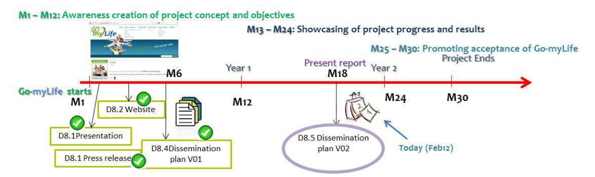
Figure 1: Dissemination plan status

The following picture summarizes our plan and the steps achieved as well as the pending timeframe: