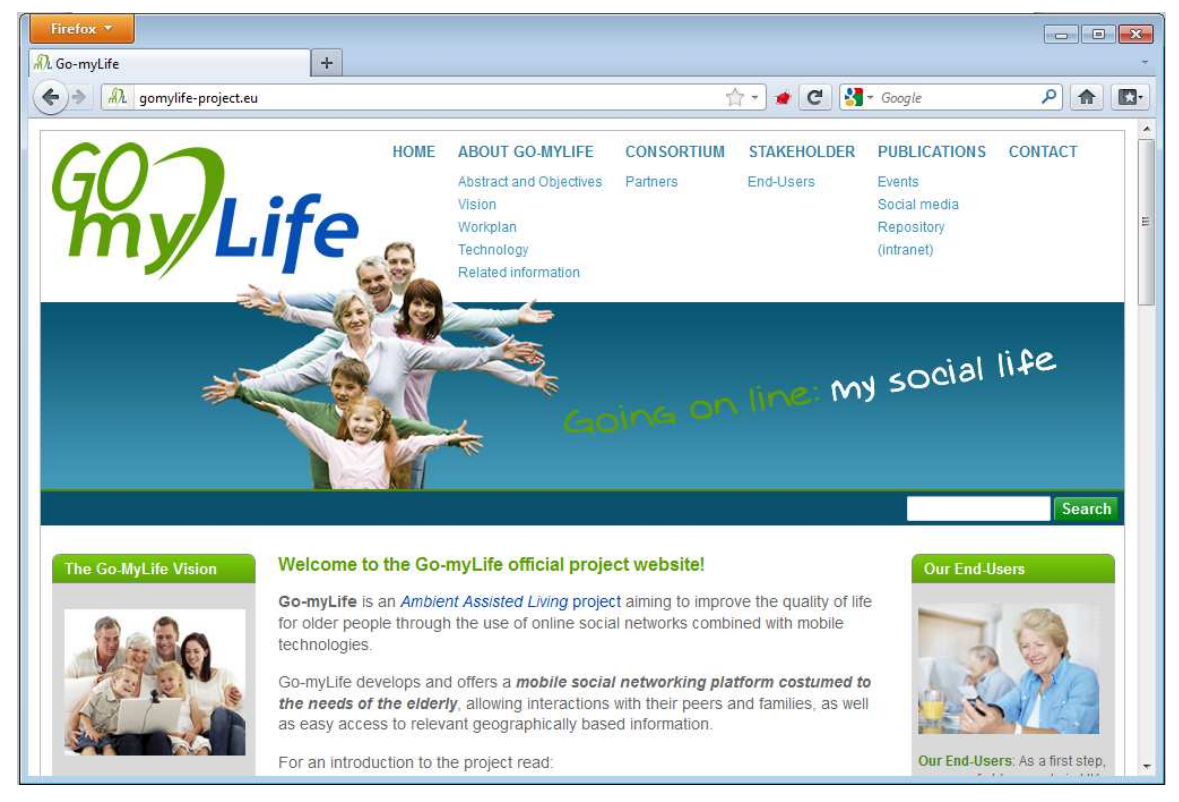
Figure 5: Go-myLife website

The site is structured in the following sections described broadly: