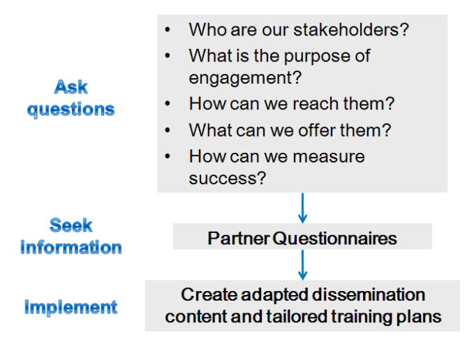
Figure 2: Work scheme towards identifying our target audience

An important horizontal activity within WP8 was to identify our target audience, as presented in Figure 2. We approach the various groups of target audiences; we transmit them a clear idea of the purpose of our engagement with them, the communication channels through which we can reach them, the content we can offer and the criteria by which we will measure the success of our engagement with them. The analysis and plans presented in this section have evolved as the project progressed as presented in deliverable D7.1 Social Impact and Economic benefits (submitted at M8).