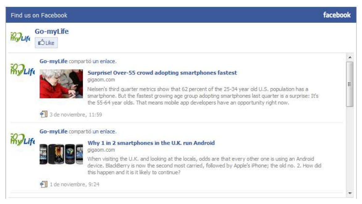
Figure 6: Go-myLife on Facebook

Facebook is one of the most important and commonly used online Social Networks in Europe, as well as among the target group of older people. Creating a page on Facebook permits the project to disseminate its activities, highlighting the project news and events, as well as to promote discussion on selected topics.