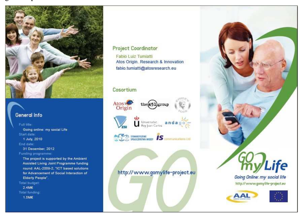
Figure 7: Leaflet front side

The Go-myLife flyer is a single page leaflet to promote our project. Distributing flyers at events is an easy and cost-effective way to reach our target audience as well as the general public.