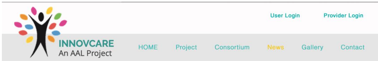
Figure 3 InnovCare Website – Header – the LOGIN