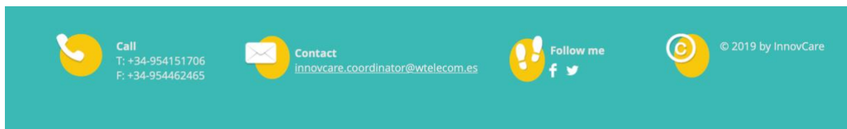
Figure 4 InnovCare Website – Footer