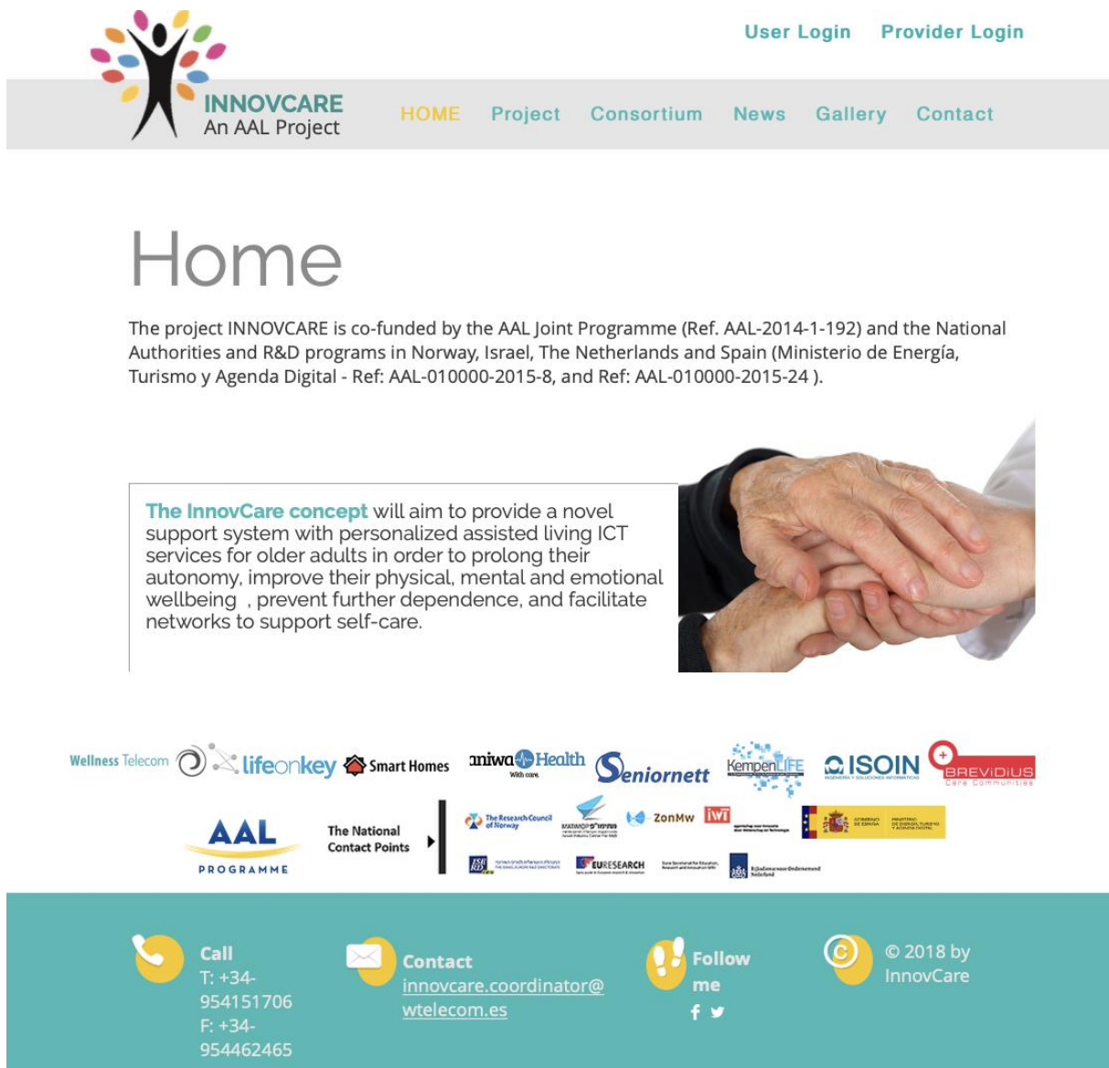
Figure 2 InnovCare Website – Home