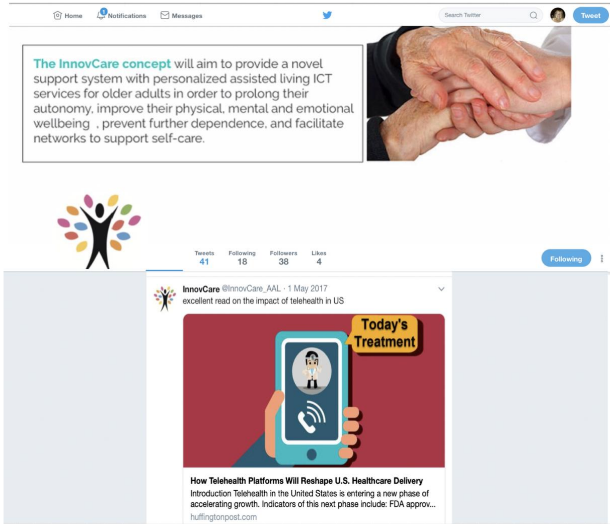
Figure 5 InnovCare Twitter Account

The partners have taken turns to tweet – not always at the pace we could have