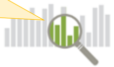
The Caregivers Portal (CGP) and the Formal care Givers

New logos can especially be created for the 4 key modules