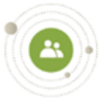
Description of Telemonitoring KIT