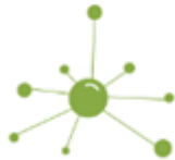
Description of the Apps