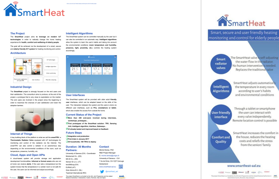
Figure 3: Poster and banner of the project