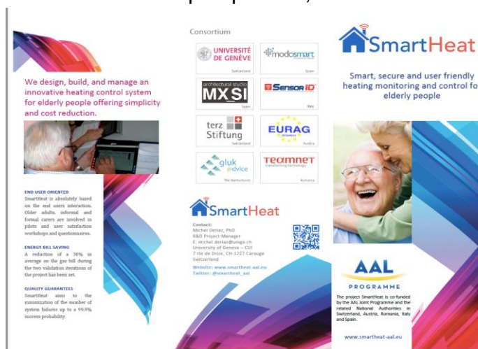
Figure 2: Project's leaflet

We have developed two project leaflets. The first one was targeted to be used as an introductory material of the project to events and relative audience and the second one description was more “product” oriented description. Furthermore, for presentation needs we had developed posters, banners and relative material.