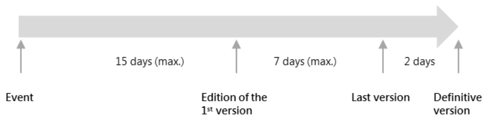
Figure 1 Minutes acceptance procedure

Minutes must be generally available within 15 (fifteen) days after the meeting. After the first release, partners involved will be allowed to revise, propose modifications or submit comments within the timeframe of 1 (one) week. Once having a final version, the document will be accepted as definitive by the hosting partner. The procedure is visually represented in Figure 1.