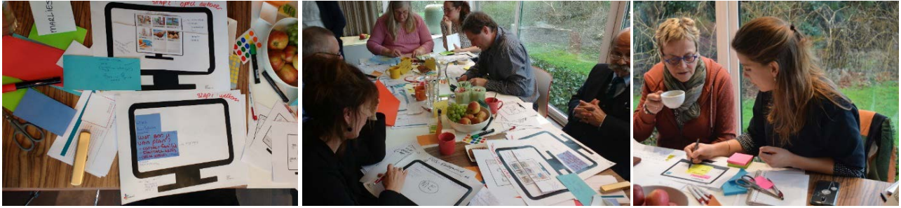
Figure 2: Example of a co-creation session conducted for the PaletteV2 project