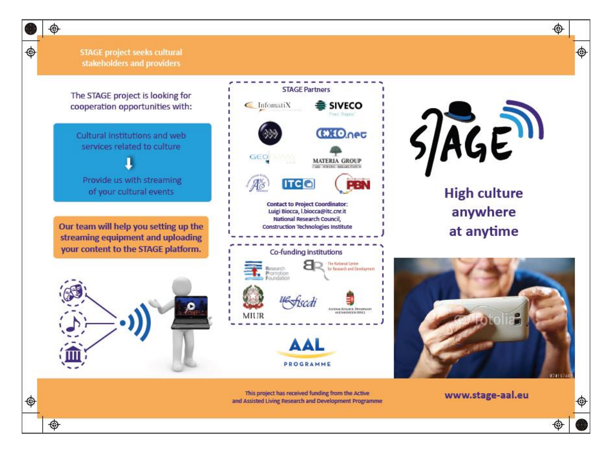
Figure 10. STAGE leaflet - 1st page