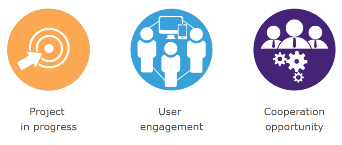
Figure 6. Screenshot from the STAGE website

The project consortium finds the aforementioned areas very important, hence the website presents them separately in a form of interactive (clickable) circles.