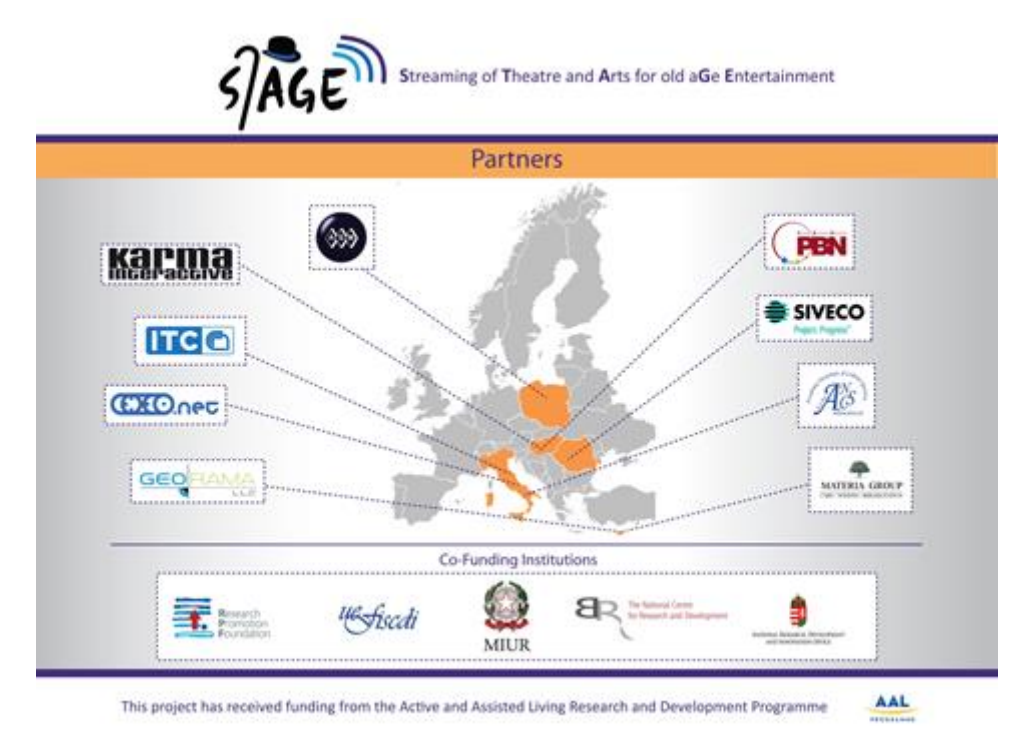
Figure 5. PowerPoint presentation - the last slide