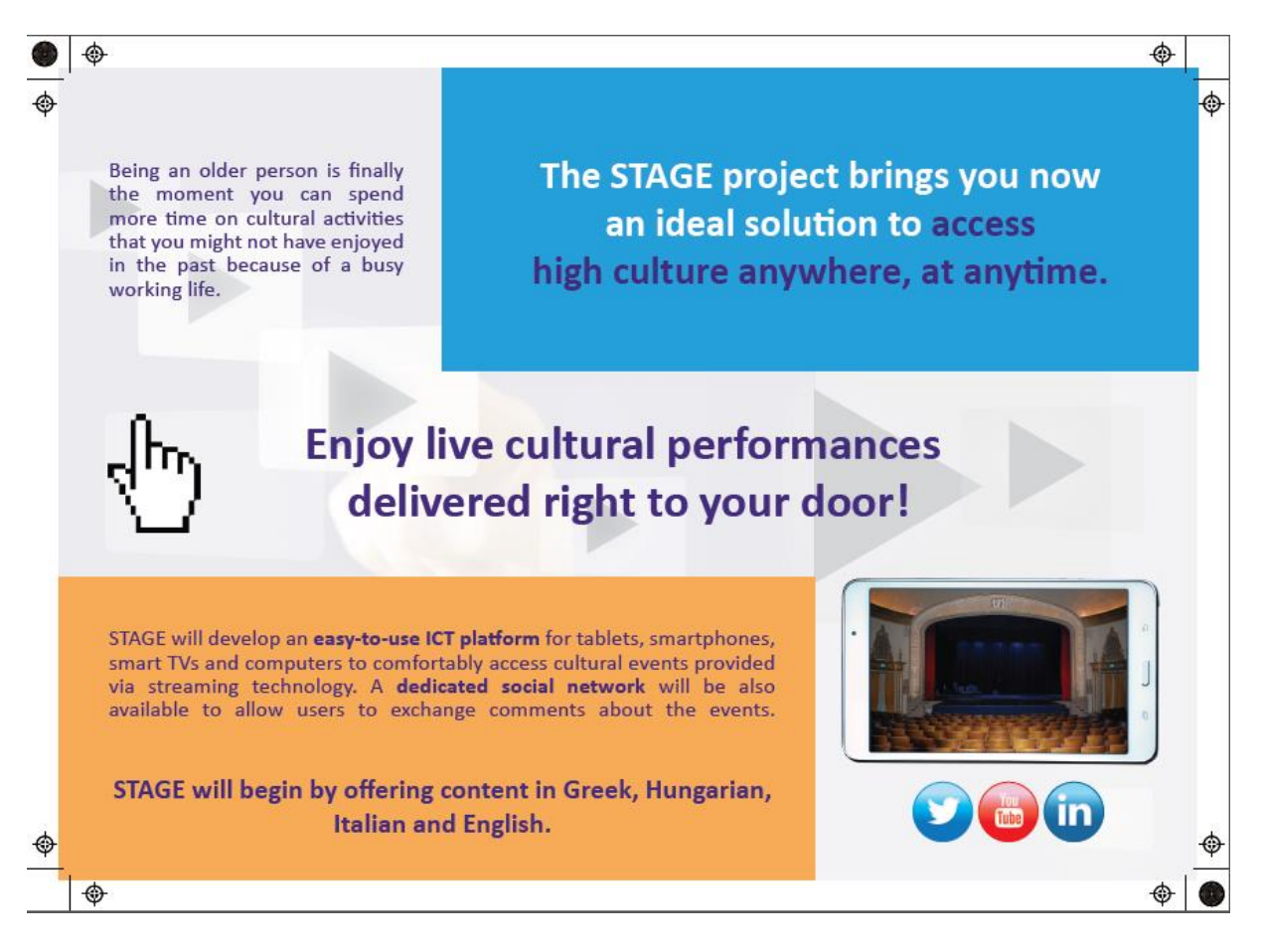
Figure 11. STAGE leaflet - 2nd page