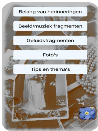
FIGURE 4. REMINISCENCE APP