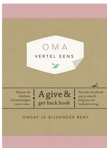
FIGURE 3. BOOK TO FILL IN LIFE STORY

After that, two digital tools, with the same idea behind it, were shown: A reminiscence app at a tablet, which showed pictures from the early years of the respondent and a digital tool at a laptop to facilitate a life story digitally.