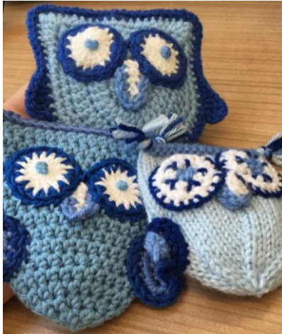
FIGURE 1. LITTLE PRESENT TO THANK RESPONDENTS