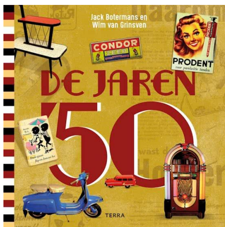
FIGURE 2. BOOK ABOUT THE FIFTIES

For this question first two books were used. One did contain pictures from the fifties in all kind of categories; the other was a book with questions to be filled in by grandparents to write a book about their life for their grandchildren. Most respondents agreed that the book with pictures would help better to facilitate a conversation than the questions. These questions would be hard to read, to understand and to answer, which would make the people with dementia feel insecure.