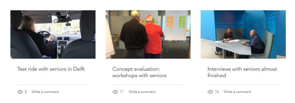
Figure 5: CARA website partner presentation and news items