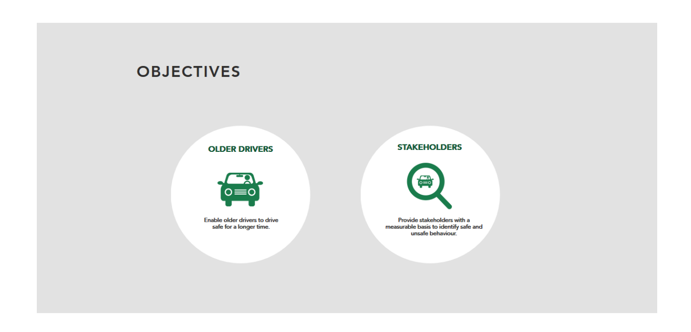
Figure 3: CARA website project information