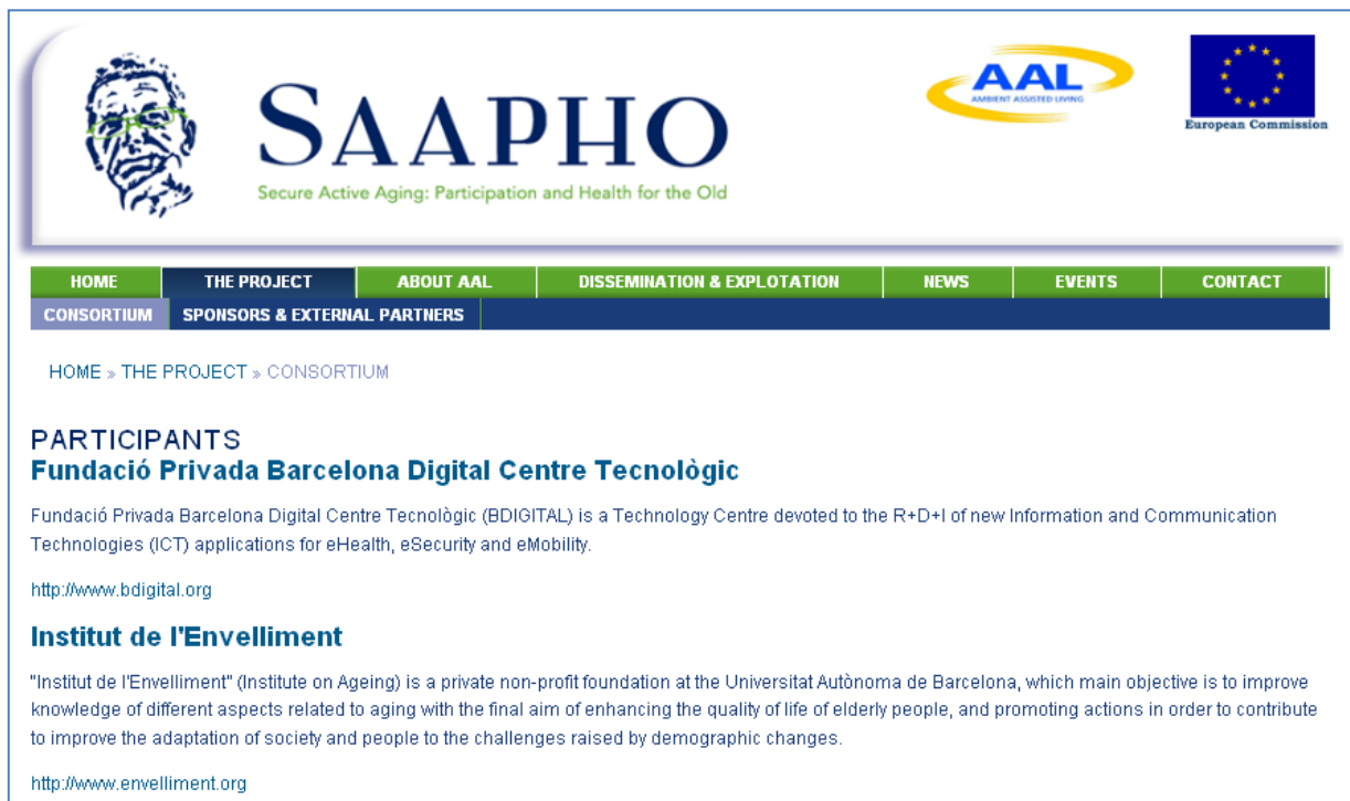
Figure 3: SAAPHO website Consortium section

The partners' description highlights their specific expertise for and their role in the project.