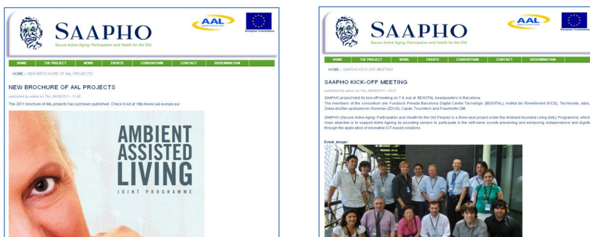
Figure 4: SAAPHO website News and Events sections

The SAAPHO website includes detailed information on related meetings and events: description, goals, dates, times and locations; as well as updated news related to all the stakeholders of the project.