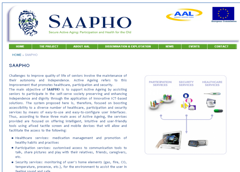
Figure 1: SAAPHO website Home page

Visitor's first impression of our site, the page presents what the project is about: the vision, mission and objectives of SAAPHO project. The section includes highlights on Events and News, listed in separately.