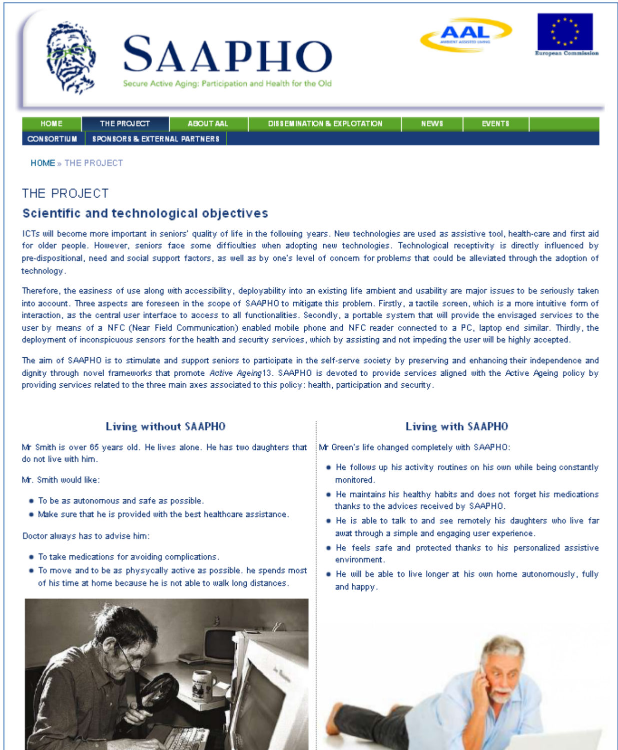
Figure 2: SAAPHO website The Project section

This section highlights the vision and mission of the overall research of the project, as well as the work plan and the objectives targeted by the project, providing an analysis of specific problems addressed by the project and the proposed solutions focusing on research and innovative aspects.