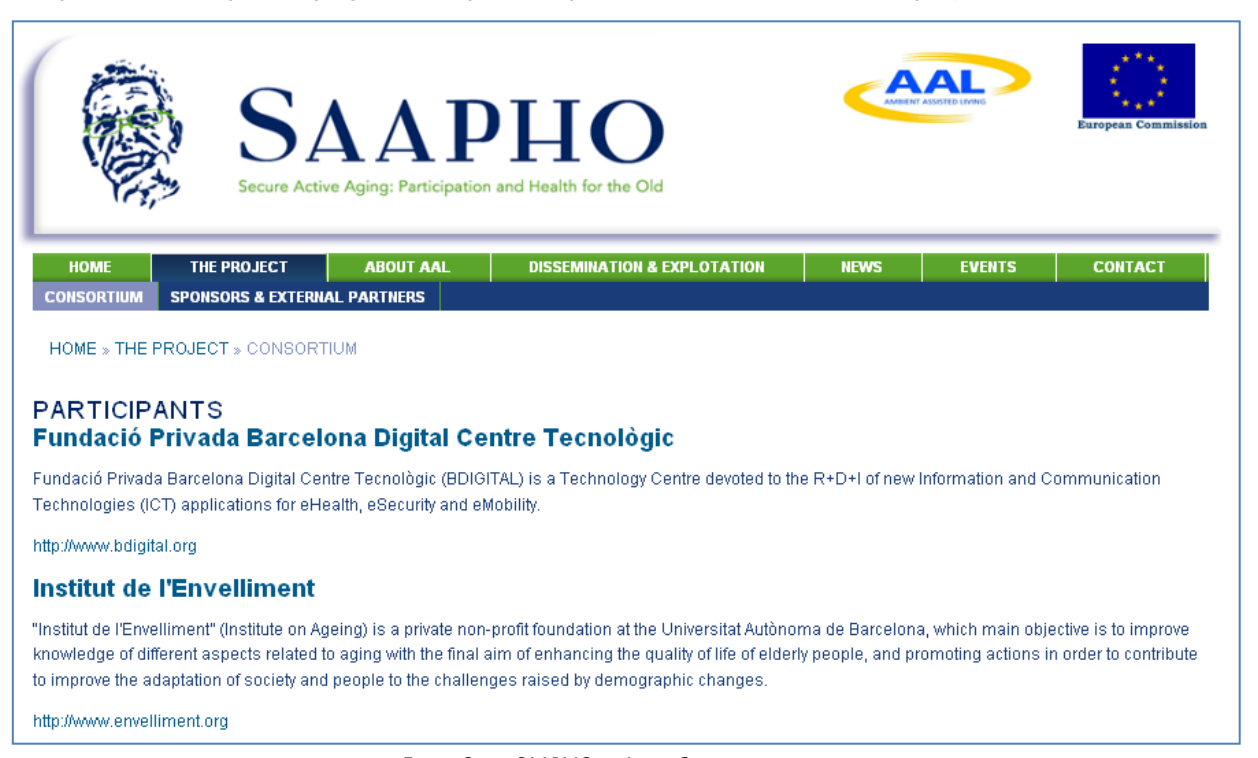
Figure 3: SAAPHO website Consortium section

The partners' description highlights their specific expertise for and their role in the project.