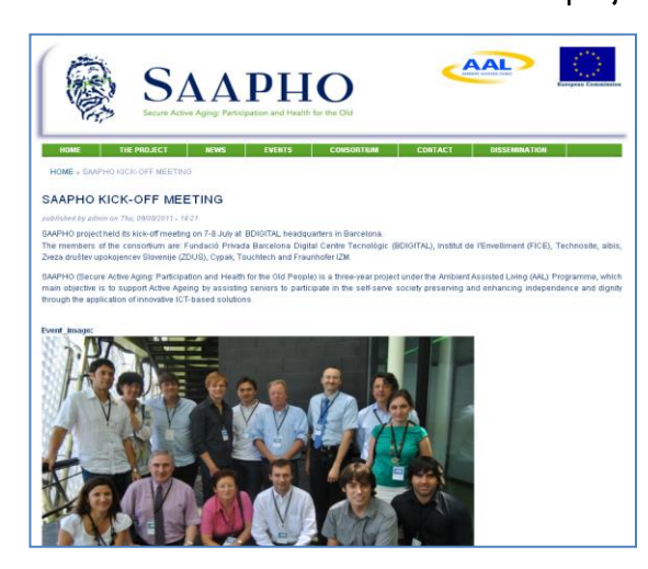
Figure 4: SAAPHO website News and Events sections

These pages will also recommend links to other projects and institutions, EC portals, and interesting informational websites. These pages can also be used to post interesting articles that others have written, thereby reserving the formal "Publications" subsection within Dissemination & Exploitation section, for the project's own articles.