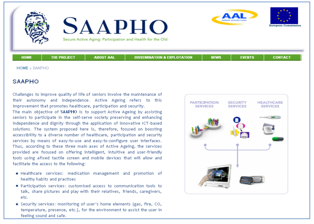
Figure 1: SAAPHO website Home page

Visitor's first impression of our site, the page presents what the project is about: the vision, mission and objectives of SAAPHO project. The section includes highlights on Events and News, listed in separately.