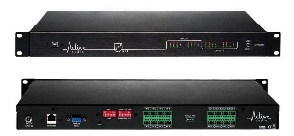
Figure 1 : Front and rear panels of the NUT processor.

NUT is a digital audio processor having 8 symmetrical analog inputs and 8 symmetrical analog outputs. It can be remote controlled with a PC or many other devices, via ethernet, USB, or RS232. Figure 1 shows the front and rear panels of the NUT processor. More information on NUT can be found on <u>www.activeaudio.fr</u>.