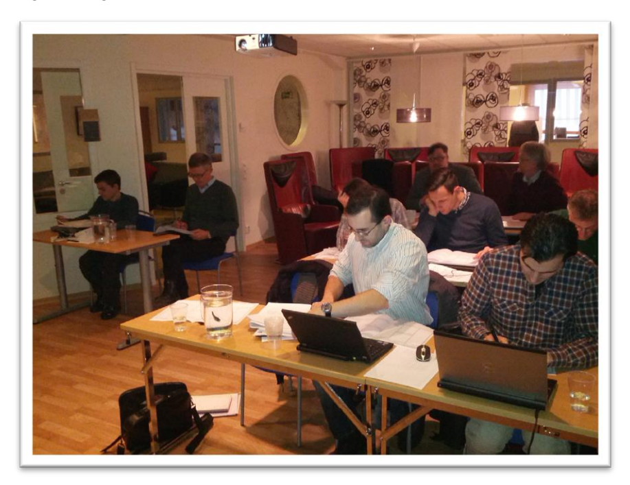
Figure 4. Picture taken during the face-to-face meeting

A second face-to-face meeting was held on the 14<sup>th</sup> and 15<sup>th</sup> of January in Skellefteå (Sweden) and hosted by EXP. The objective of this face-to-face meeting was to discuss all the issues related to the end of WP2 and the start of WP3, WP4 and WP5. The requirements gathered during the WP2 execution and the work plan for WP3, WP4 and WP5 were discussed. The general architecture of the ELF@Home was also discussed focusing on technical and user aspects. Figure 4 shows a picture taken during the face-to-face meeting and Table 6 the list of attendants. A meeting with the end-users of the solution (SKO) was also held during the face-to-face meeting (see Figure 5).