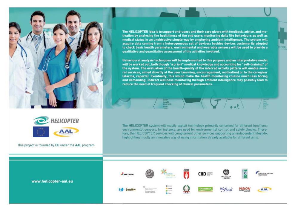
Figure 2_Internal Page