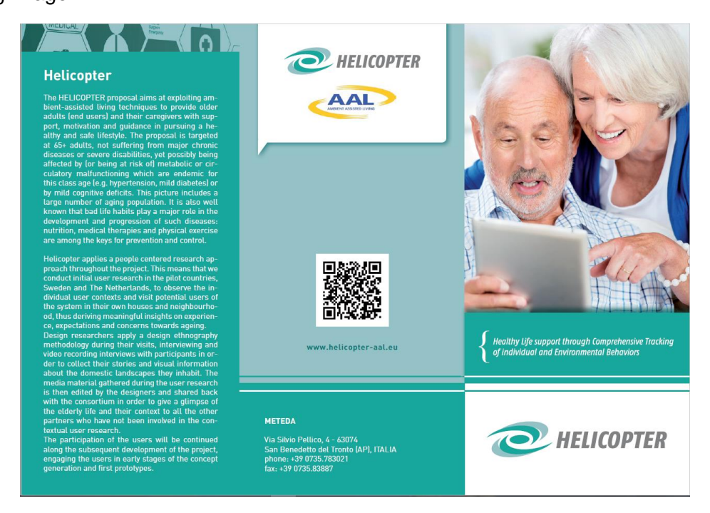
Figure 1_Back Face

The leaflet has been designed in a A4 format coloured sheet, and folded three times as the following image: